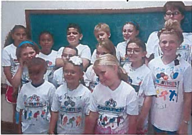
Saints of the Day!