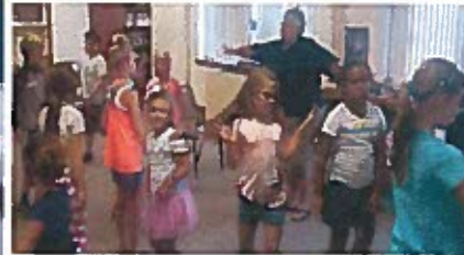
Training for Christ!