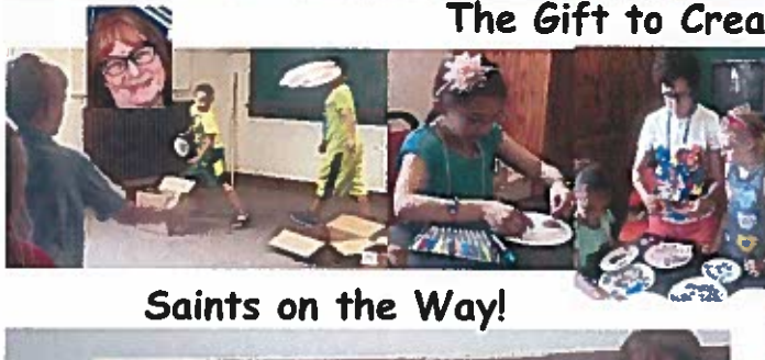
Saints on the Way!