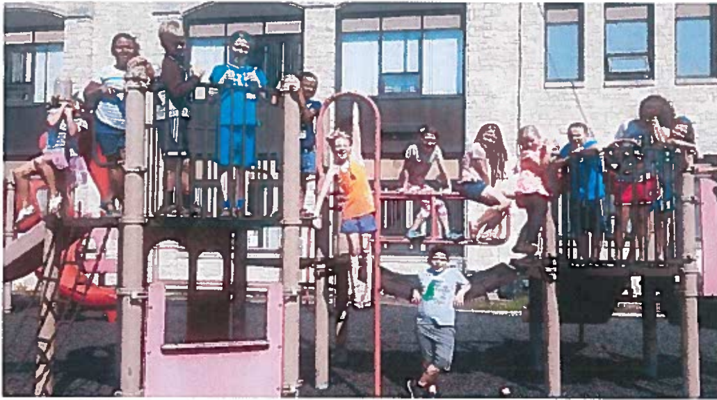
The Gift to Create!