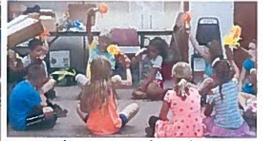
Champions for Christ!