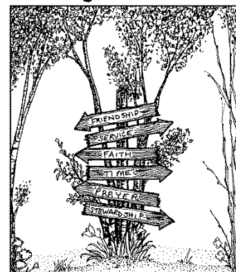
Choose to Walk with the Lord