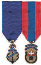
Diagram 2 Past Grand Knight Past Faithful Navigator