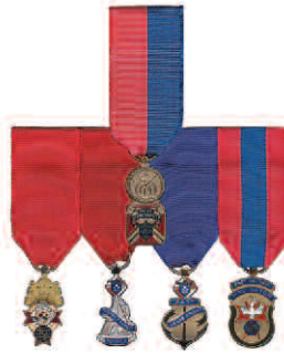
Diagram 5 Past State Deputy Former District Master Former District Deputy Past Grand Knight Past Faithful Navigator