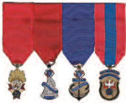
Diagram 4 Former District Master Former District Deputy Past Grand Knight Past Faithful Navigator