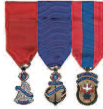
Diagram 2 Former District Deputy Past Grand Knight Past Faithful Navigator