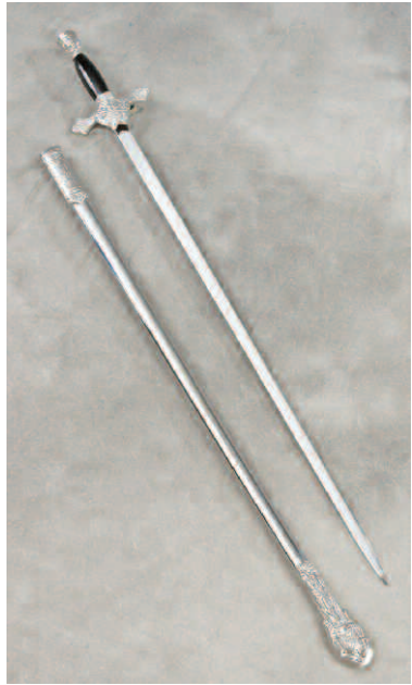
Black Handled Sword with Scabbard