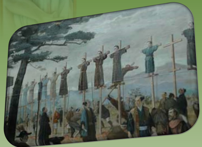
St. Paul Miki and Companions, Martyrs in Japan c. Mid 1800s February 6th, Memorial